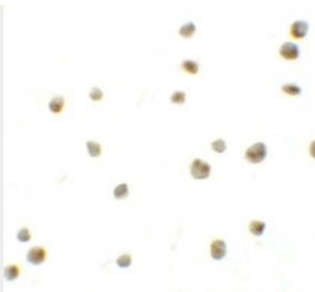
Immunocytochemistry of DYRK2 in 293 cells with DYRK2 antibody at 10 µg/mL.